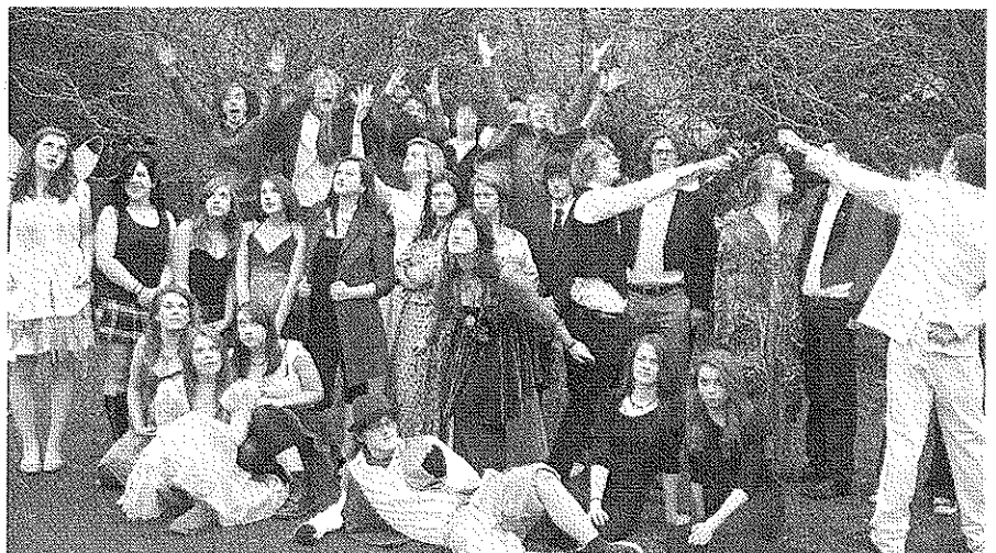
Some of the cast