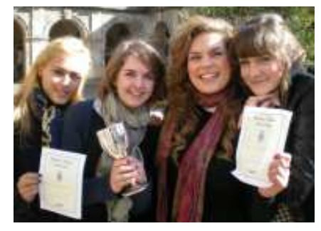
'The Soul Sisters'