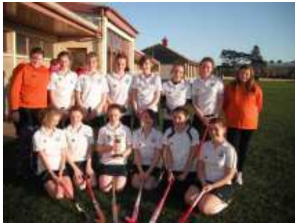
Winners of the Fife Schools' Hockey Tournament

Season 2011-12 has been a very successful one, with all year groups competing in regular Saturday morning fixtures, with very few cancellations, unlike last season. Although not all girls are available to play on a Saturday, many enjoy supporting the extra curricular clubs.