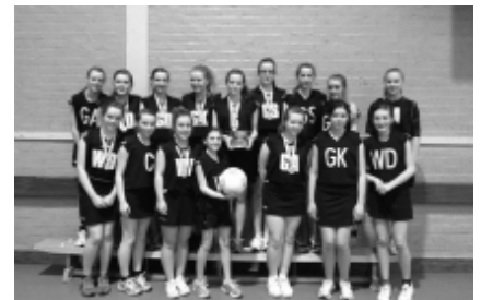
Pictured above are the S2 Girls' Netball Team who won the Fife Schools' Championship this term.