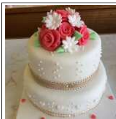
National 5 classes