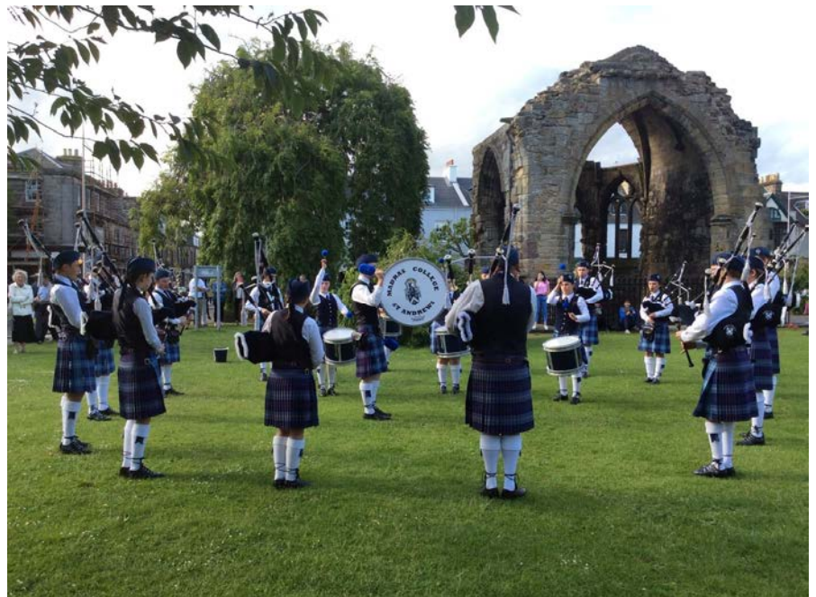
Madras College Pipe Band play on a sunny Saturday evening to welcome guests to the German Kiel Exchange 60th Anniversary Ceilidh

What an achievement! We believe that our German exchange with the Kieler Gelehrtschule in Kiel, Schleswig-Holstein is the oldest unbroken school-to-school exchange between the two countries. To celebrate this amazing milestone in the history of the exchange, a number of special activities took place during the 60th exchange visit.