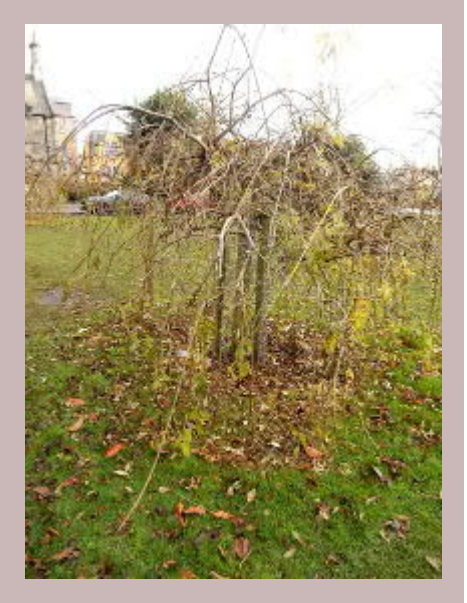
Two similar trees, one of which has a plaque with the inscription:

Presented by the Association for International Cancer Research to Madras College and the city of St Andrews 8 March 1995