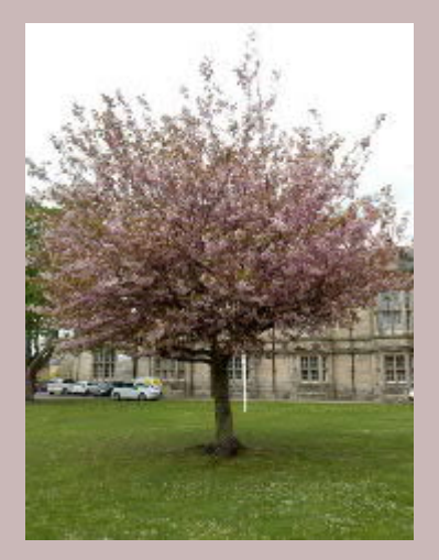
This gean is a later tree planted to replace the flowering cherry which was planted in the centre of the lawn.

In 1951 as part of a policy to plant more trees in St Andrews the Preservation Trust planted a flowering cherry in the centre of the forecourt of Madras College to replace a headless oak .