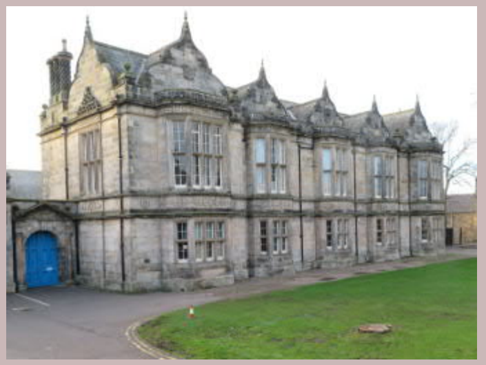
Tree removed 2018